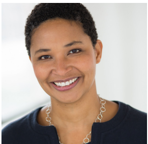
DANIELLE ALLEN Harvard University

How INEQUALITY AND WEALTH CONCENTRATION ARE SHAPING AMERICAN DEMOCRACY